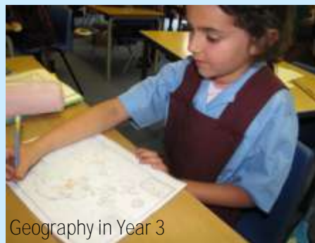
Geography in Year 3