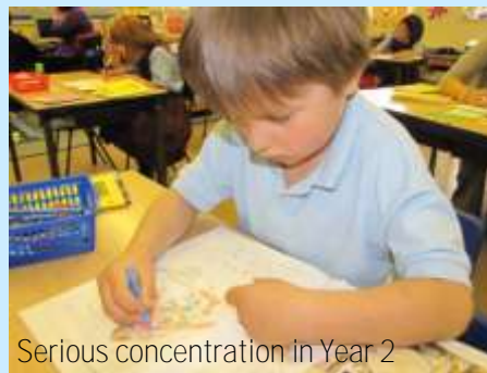
Serious concentration in Year 2