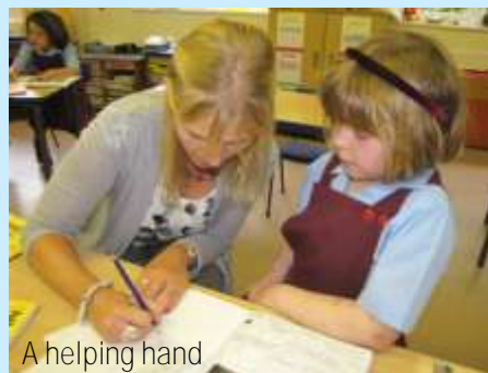
A helping hand